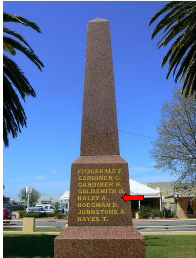
St. Helen's War Memorial