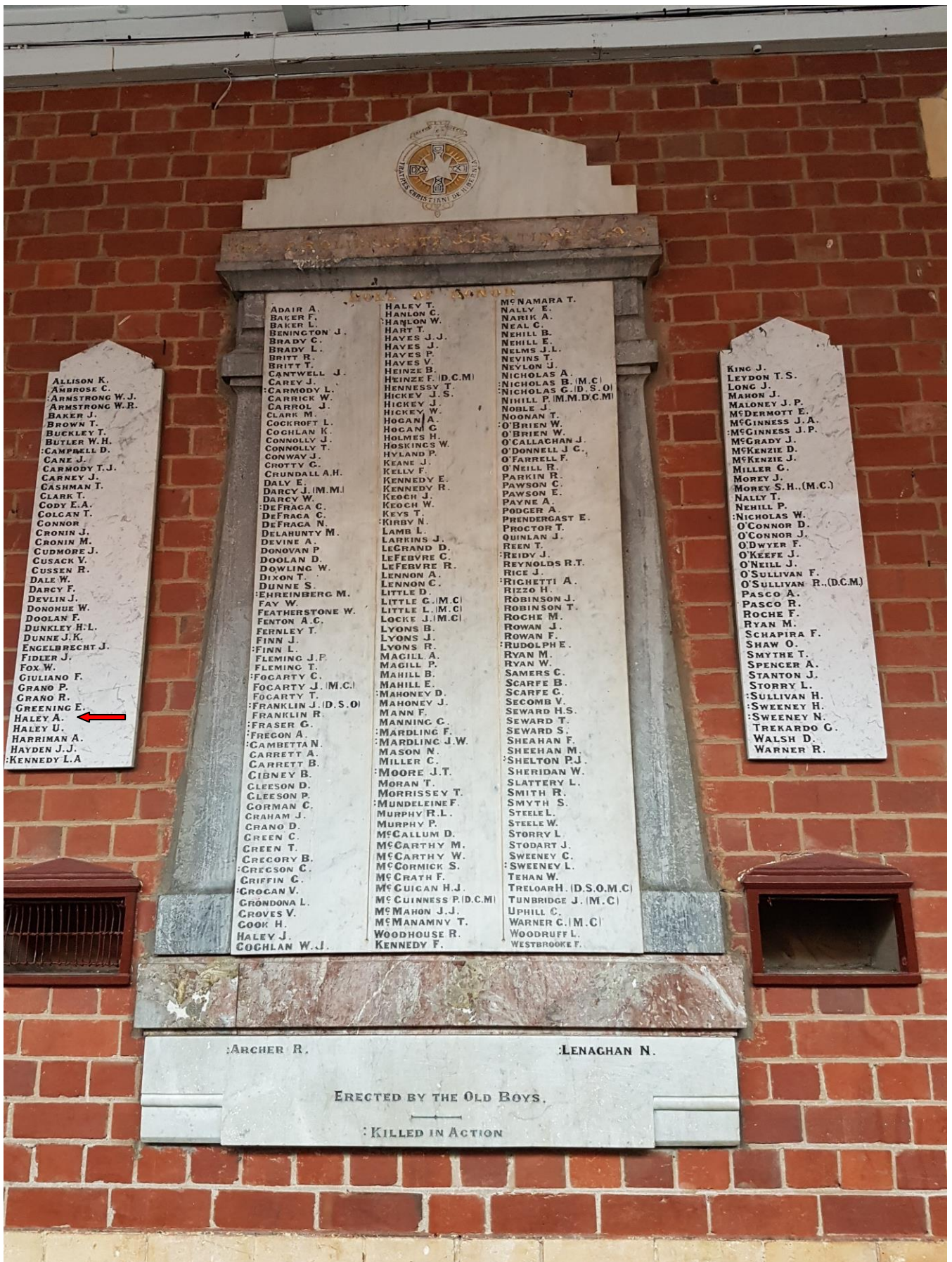
St. Patrick's College, Ballarat – Roll of Honour